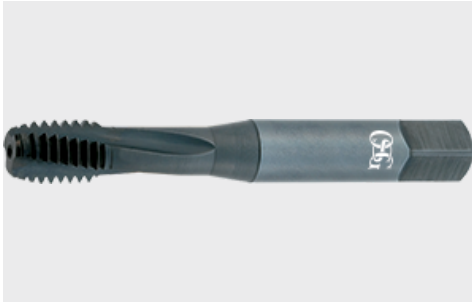
List 345STI EXOTAP® VC-10 Taps