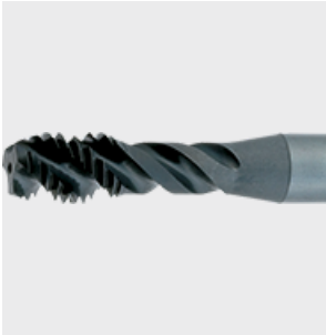
List 343 EXOTAP VA-3® Taps