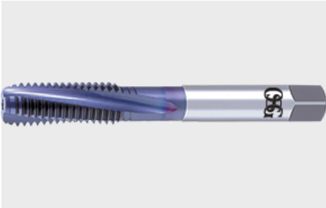
List 345TI EXOTAP® VC-10 TI Taps